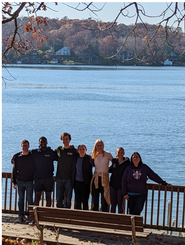
Fall 2022 Leadership Retreat

You will be joining a special group of supporters who have made a commitment that ensures LCMNU is present for future generations of students.