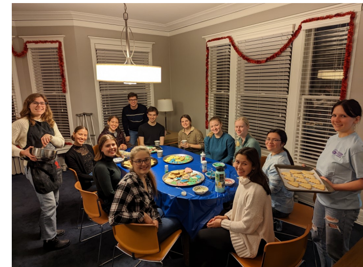
LCMNU Christmas 2022 Cookie Baking

Last year, friends of LCMNU were welcomed to our first in-person Showcase fundraiser since before the pandemic. It was wonderful, and we hope that you can join us for the LCMNU Showcase 2023 on April 29, 2023! More details about the event can be found at: https://mcelca.org/ministries/campus/