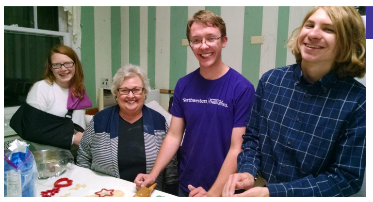
Baking cookies at LCMNU 2017 Christmas Celebration