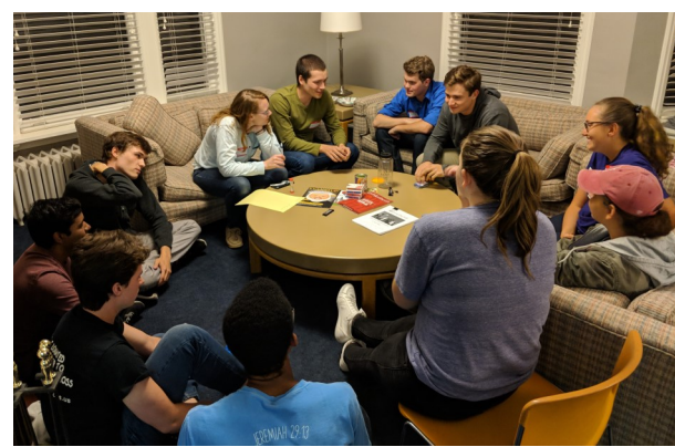
Game Night at LCMNU