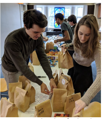
Preparing lunches for local shelter