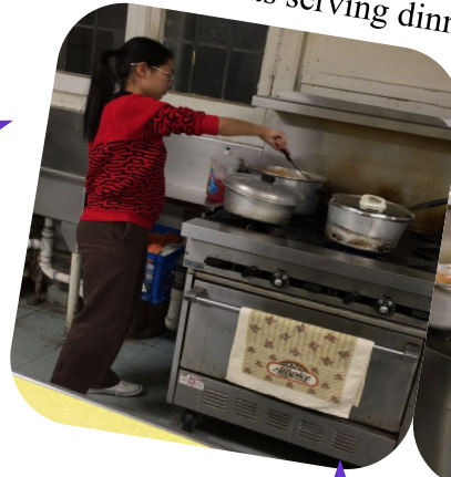
Students serving dinner at Hilda's Place.