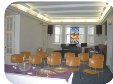
Renovations at ULC