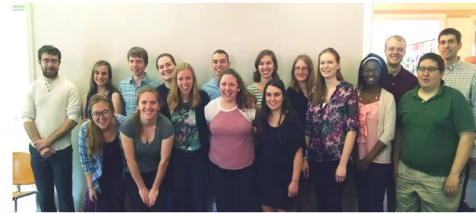
Above: LCMNU students gather after End of Year Worship Service and Recognition of Graduates

LCMNU is a welcoming community experiencing, living, and sharing the love of God through scholarship, service, and faith.